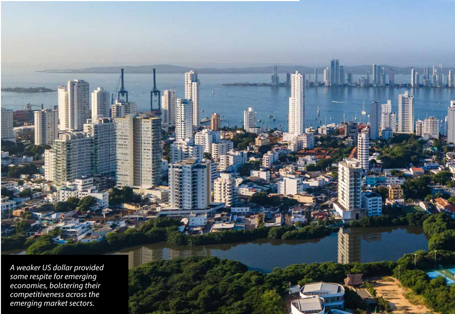
A weaker US dollar provided some respite for emerging economies, bolstering their competitiveness across the emerging market sectors.

Despite some bright spots, certain regions struggled in December. The Indian market faced growth concerns, leading to significant declines exacerbated by weak financial markets and a lack of clear policy direction. Similarly, Malaysia and the Philippines recorded some of the steepest